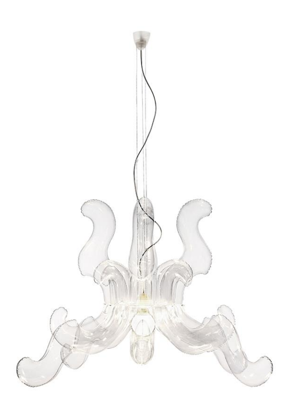
DESIGN - Anna Siedlecka & Radek Achramowicz

DESCRIPTION – Pendant lamp with big flexible, airfilled shade in transparent PVC. An elegant concept that appeals to Murano glass. The air is the main material, which the lamp is built of, that's why despite its size the lamp is very lightweight.